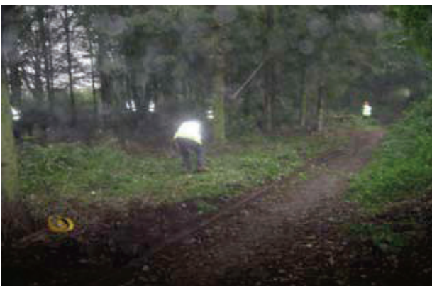
Conservation volunteers working

Over a number of years, the Forest of Mercia team have developed effective partnerships to invest in the redevelopment of Christianfields Local Nature Reserve (LNR), a former refuse site on the edge of north Lichfield. More recently they identified the need to improve part of the Erasmus Darwin Walk, a 10 mile circular route around the edge of Lichfield, running alongside the LNR. Part of the route was not designated as a public right of way and was in a state of neglect. The P4C project has provided an opportunity to formally designate the footpath, which connects to a number of other public rights of way.