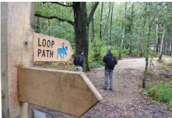
Sam and Roy discuss the new route

The Wildlife Trust is keen to ensure all users can enjoy the woods equally. Cleverly designed chicanes are placed where downhill routes meet the new bridleway, thus slowing down the more energetic users of the woods.