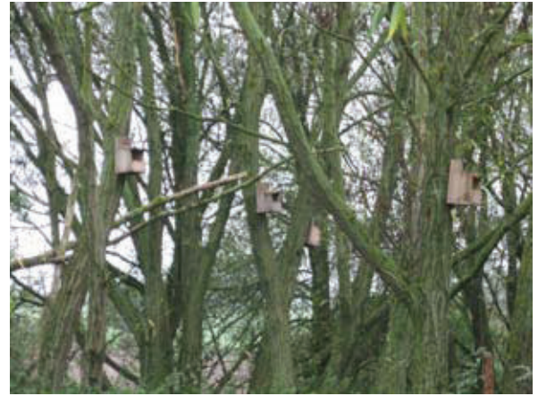
The new bird boxes

Earlier in 2013, Forest of Mercia won the Royal Forestry Society’s Sylva Cup in recognition of its work in general and the step-change achieved at Christianfields LNR, in particular. P4C funding has helped to continue with this good work.